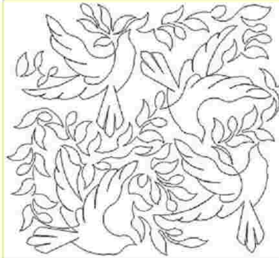
Created for the Quilts of Valor Organization. Message of Peace by Blackman Designs